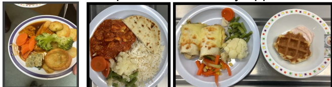
Roast Dinner Chicken Curry Beef Taco Waffle & ice-cream

We are sure that you will agree that our school lunches are much improved. The number of meals that we are providing have increased. The feedback from the children is very positive and their empty plates are a sure sign that they are enjoying the meals! Please remember to book your child's meal on the eduspot - school money app.